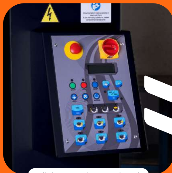
All shortcuts electronic board