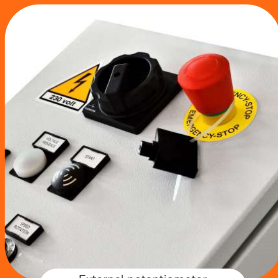
External potentiometer for turntable's speed adjustment